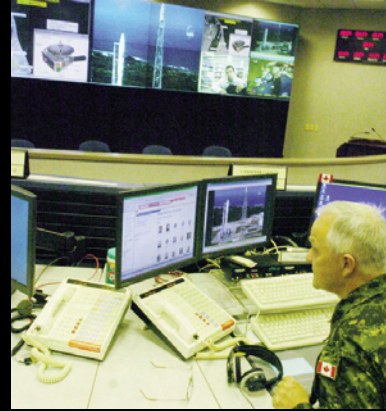
command + control