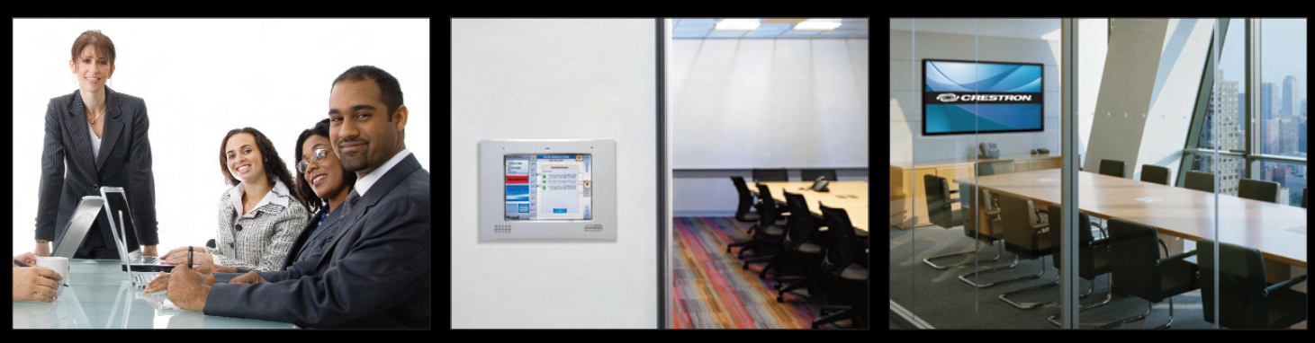
Schedule from Outlook